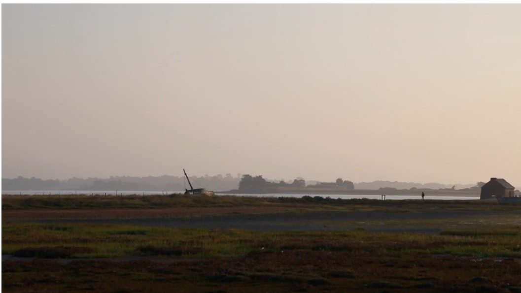
Still Image of the Video

The texts are the results of a writing workshop where the people watched the video so that they could build up a story, an interpretation of this going. Later they have read theirs texts. I recorded theirs voices and I mixed them with improvised music.