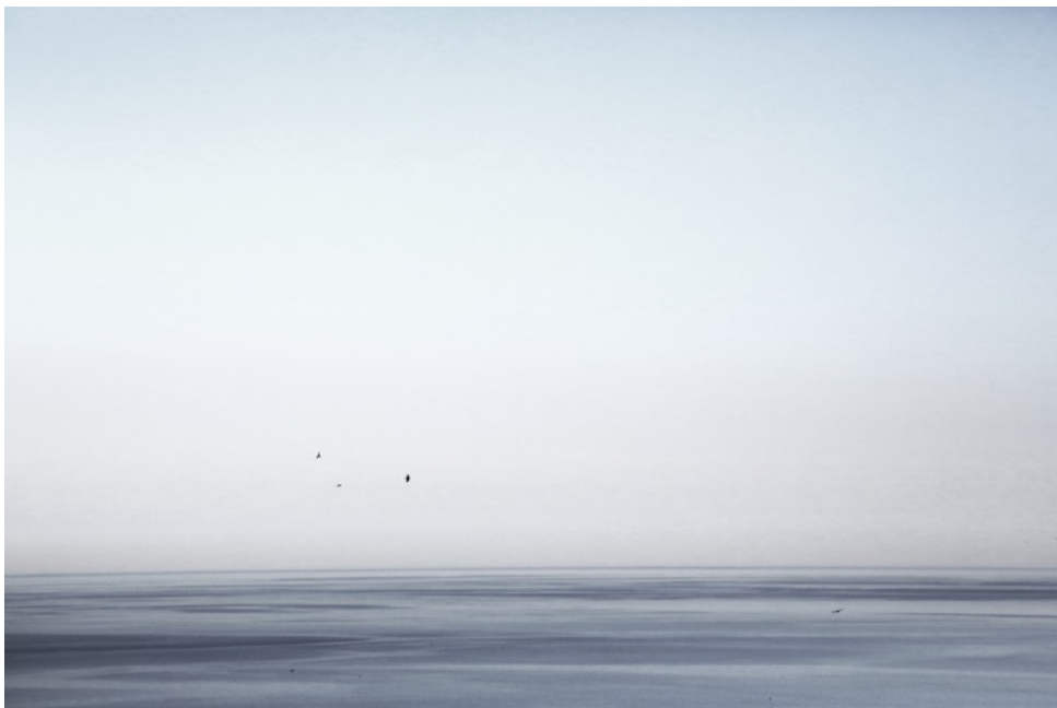
Das Meer (Photo auf Papier 30x40)

The audience hears the sound of the Water, my female voice singing and the noise of the countryside. The public let himself be carried by the sound and it is possible to look at the photos only by going through the laundry being touched by it.