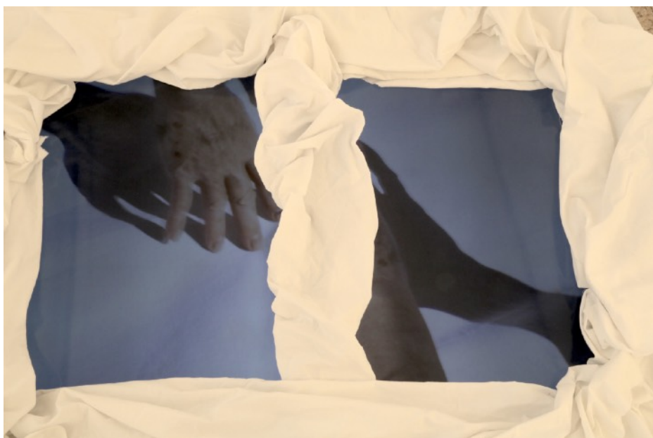
still Image of the Video

In a room of 4mt x 4mt, white sheets are moving with the air. In the middle of the room lay two monitors, surrounded by bed sheets. They screen a video about my mother's hands washing first the same bed white sheets, which are hanged and then hang them. They are filmed as a closed up, the skin of the hands, the water and the white fabric seem two marble sculptures. Behind the washing there are photos of the sea to see.